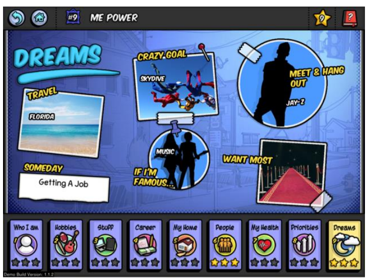
Figure 2: Creation of the Aspirational Avatar

Lesson 4: Look to the Literature. In the field of serious games research, this lesson is critically important: look to the literature; examine what has already been done and what worked or did not work. Consider what theories or frameworks were used to guide the development and/or evaluation of similar videogames (or interventions), what assessment data were collected and the methods to collect them. Systematic reviews can provide a thorough summary of current literature relevant to a specific research question [20]. For example, as part of the development of PlayForward , we conducted a systematic review on electronic media-based interventions that promote behavior