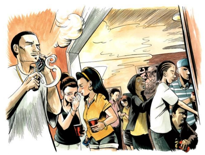
Figure 1: Storytelling Using Graphic Illustration

and looking at something outside of the frame. To create a discussion we simply asked, "What's going on here?" The teens told stories that resonated closely with their own lives and involved topics such as unplanned pregnancy, sneaking out of the house, fighting, stealing, drinking, and drug use. The content produced by this activity helped to shape many of the storylines that were built into the videogame. Another activity we used to learn about teens' future aspirations was called My Life . For this project, we created a visual timeline that extended out ten years from the teens' current age and asked them to write down any important hopes and dreams they had for themselves. We learned about life goals such as going to college, having money, being successful, and being able to take care of their parents (such as helping them with their bills) in addition to getting a driver's license or the newest PlayStation or going to prom. This activity was essential to informing the development of the Aspirational Avatar in the game. Figure 2 is a screenshot from the videogame that provides an example of the creation of the player's Aspirational Avatar .